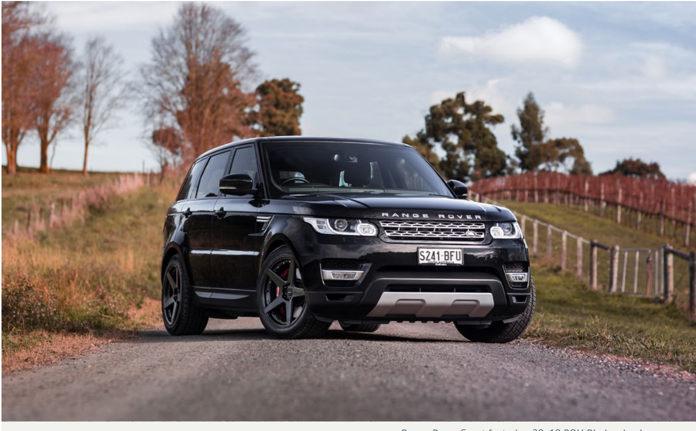
Range Rover Sport featuring 20x10 ROH Blade wheels